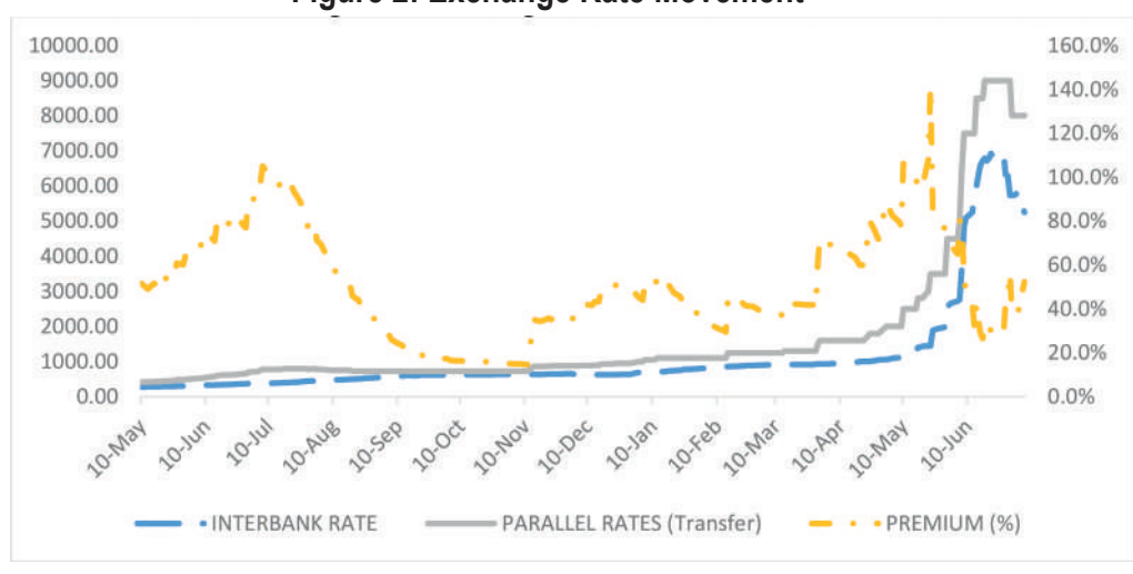
Figure 2: Exchange Rate Movement