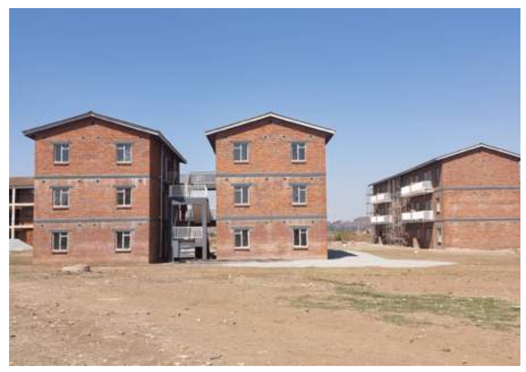
Dzivarasekwa Housing Project