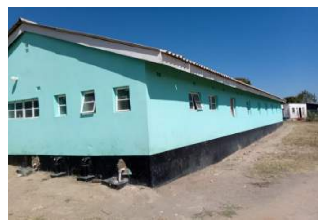
14 Roomed Barrack in Karoi