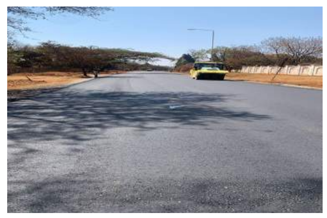
Rehabilitation of Alpes Road and Opened to Traffic, Harare