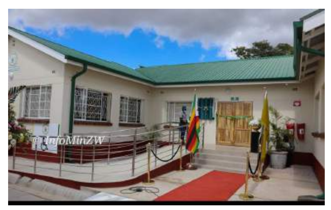
Commissioned Epworth Magistrate Court

75. The support extended during the year also facilitated the advancement of works on other key projects such as Wedza District Registry, Lupane Composite Offices, Marondera Flats, boundary wall at State House, ZRP Chimoio flats as well as Prisons and Defence facilities in barracks and cantonment areas.