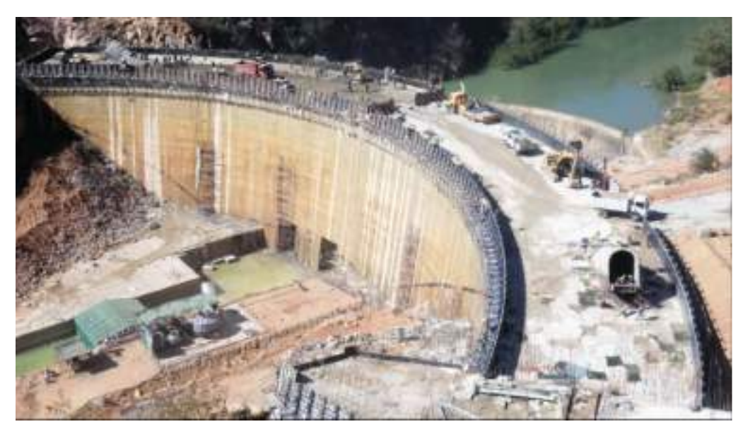
Construction of Gwayi-Shangani dam

63. Modest progress is being realised on Gwayi-Shangani dam project with work on the dam now estimated at 73% completion with the dam height now at 39m out of 72m. The revised completion date for dam construction is now set for December 2024.