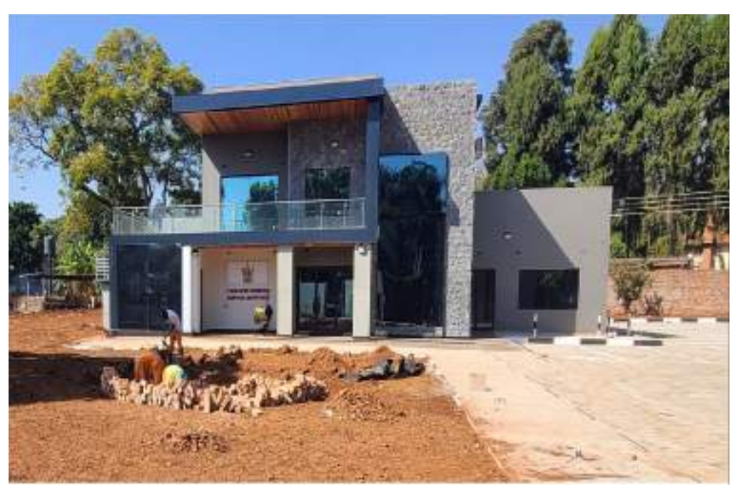
Renovated ZFSI front view (ZIMBABWE FOREIGN SERVICES INSTITUTE)