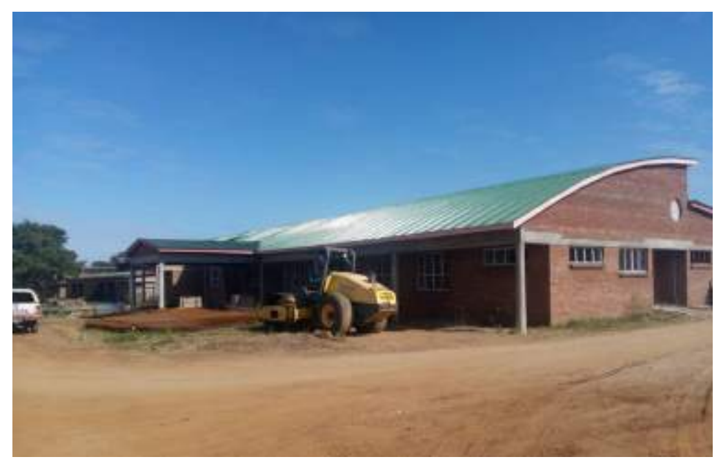
Lupane Provincial Hospital