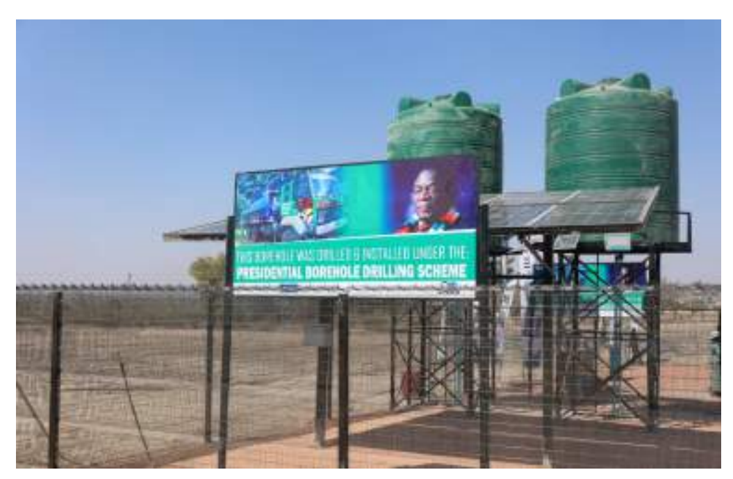
Presidential Rural Development Programme