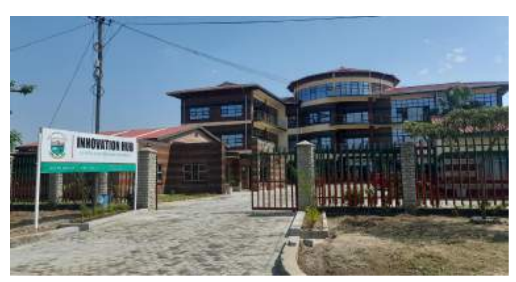
Completed Great Zimbabwe University Innovation Hub