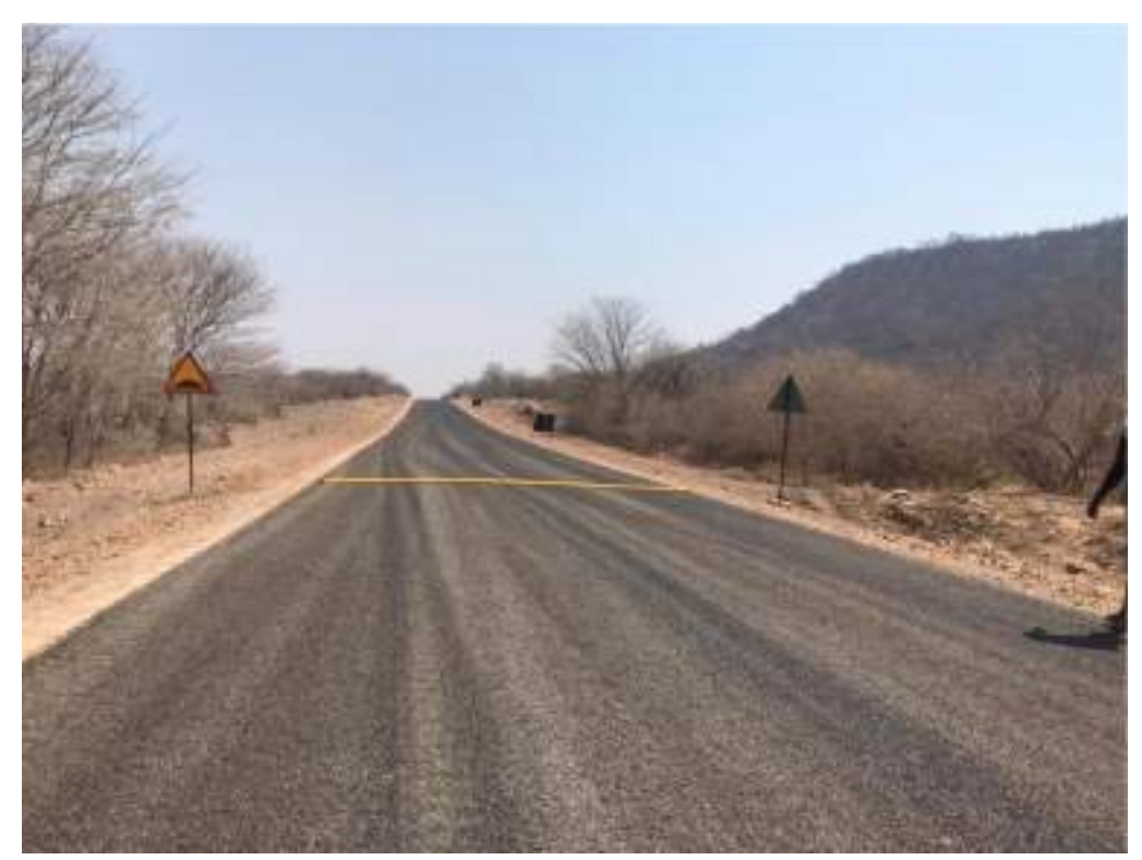
Rehabilitation of Bulawayo-Victoria Falls Road

31. Under the same sub-sector of roads, during the year, Government also embarked on rehabilitation and upgrading of Beitbridge-Bulawayo-Victoria Falls Road with 20km having been achieved and project earmarked for aggressive implementation during 2024.