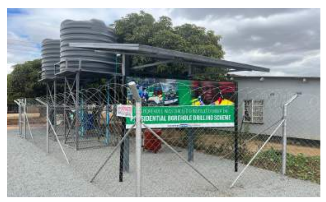
Presidential Rural Development Programme