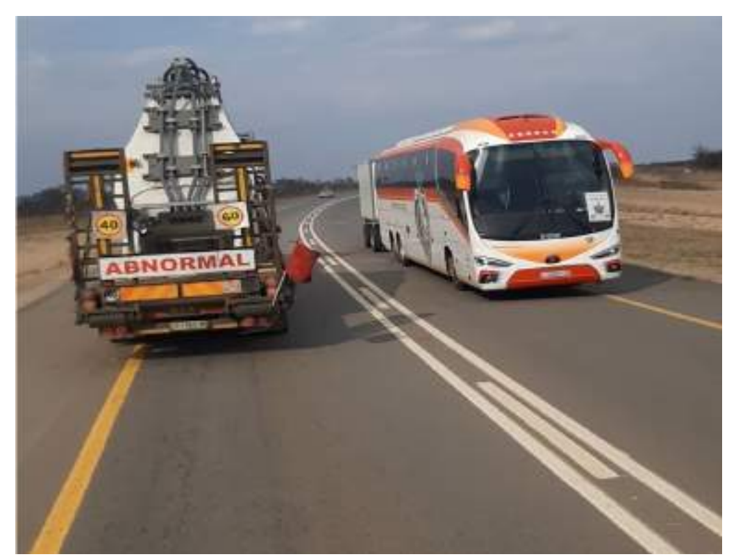
Completed Section of Harare-Masvingo-Beitbridge Road