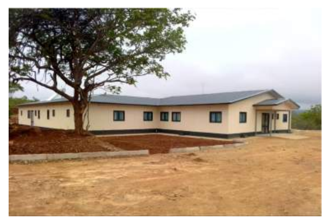
Runyararo Health Post in Chimanimani

Runyararo in Chimanimani is expected to be completed by December 2023.