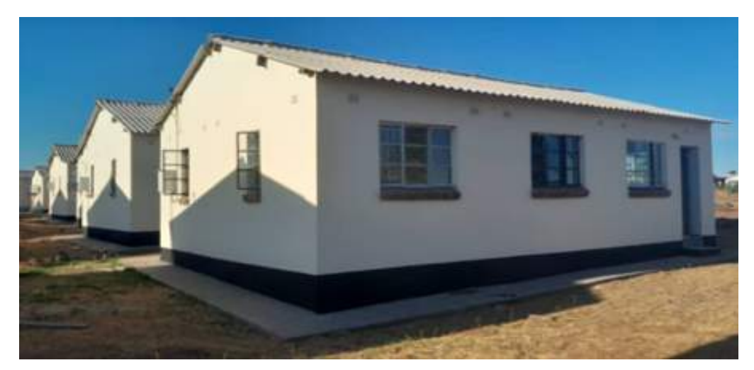
Construction of 19 Civil Servants Houses in Lupane, Matabeleland North Province