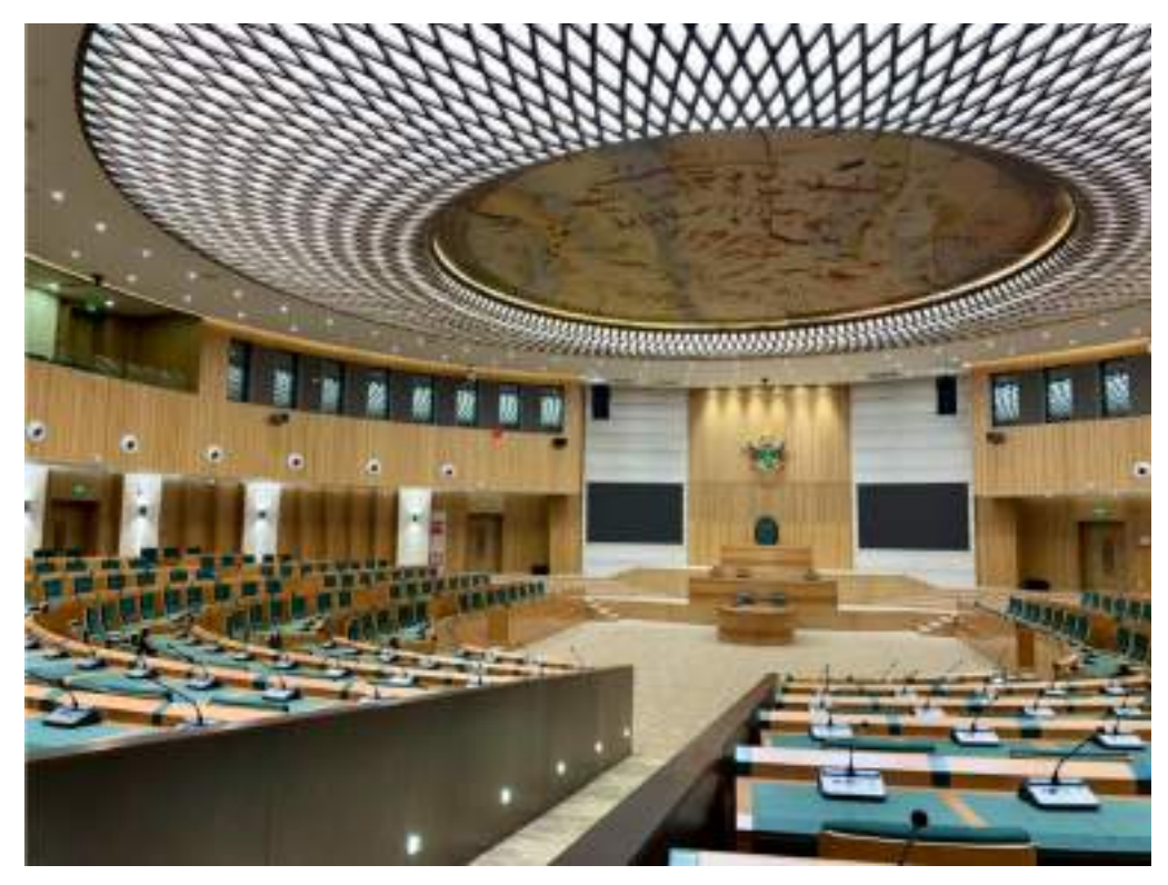
Commissioned New Parliament Building

2023, Wedza District Registry office which was handed over to Government in October 2023 and Epworth Magistrate Court in March 2023.