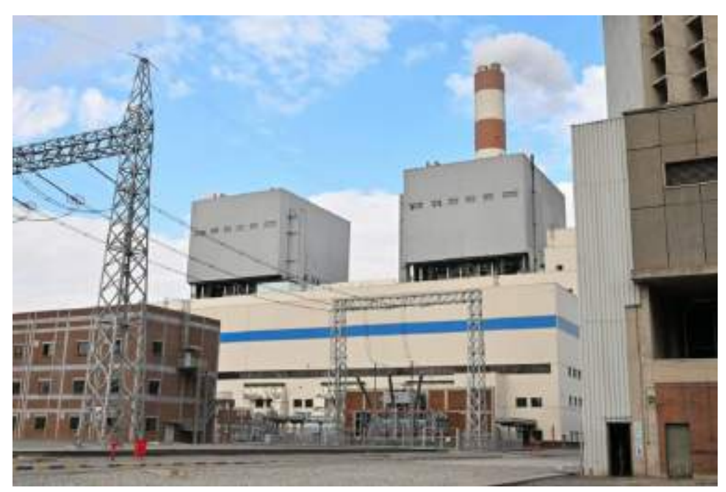
Commissioned Hwange 7 and 8 Expansion Project